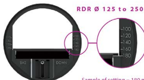
RDR Ø 125 to 250 mm