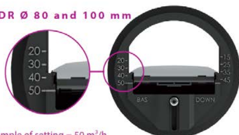
RDR Ø 80 and 100 mm

Different other possibilities of setting with intermediary positions.